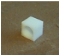
Square Drive Idler