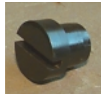
External Single Slot