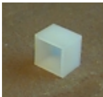
Square Drive Bushing