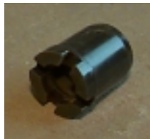
Internal Cross Slot