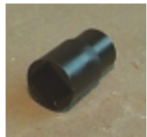
Internal Square Drive