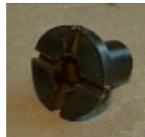
External Cross Slot