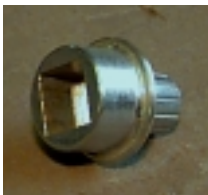
External Square Drive